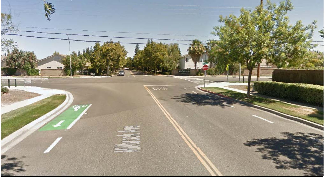
Floyd/Millbrook Intersection - Prior to Improvements