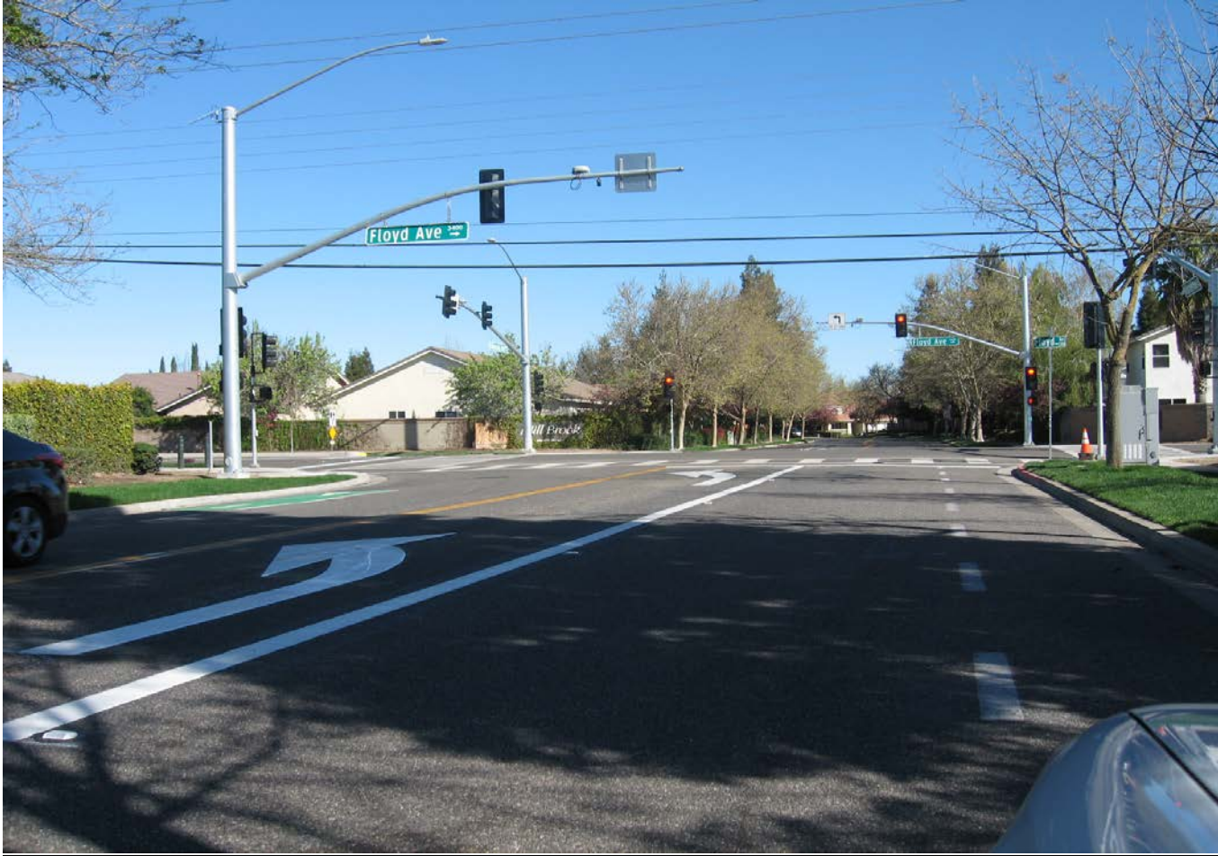
Floyd/Millbrook Intersection - After Improvements