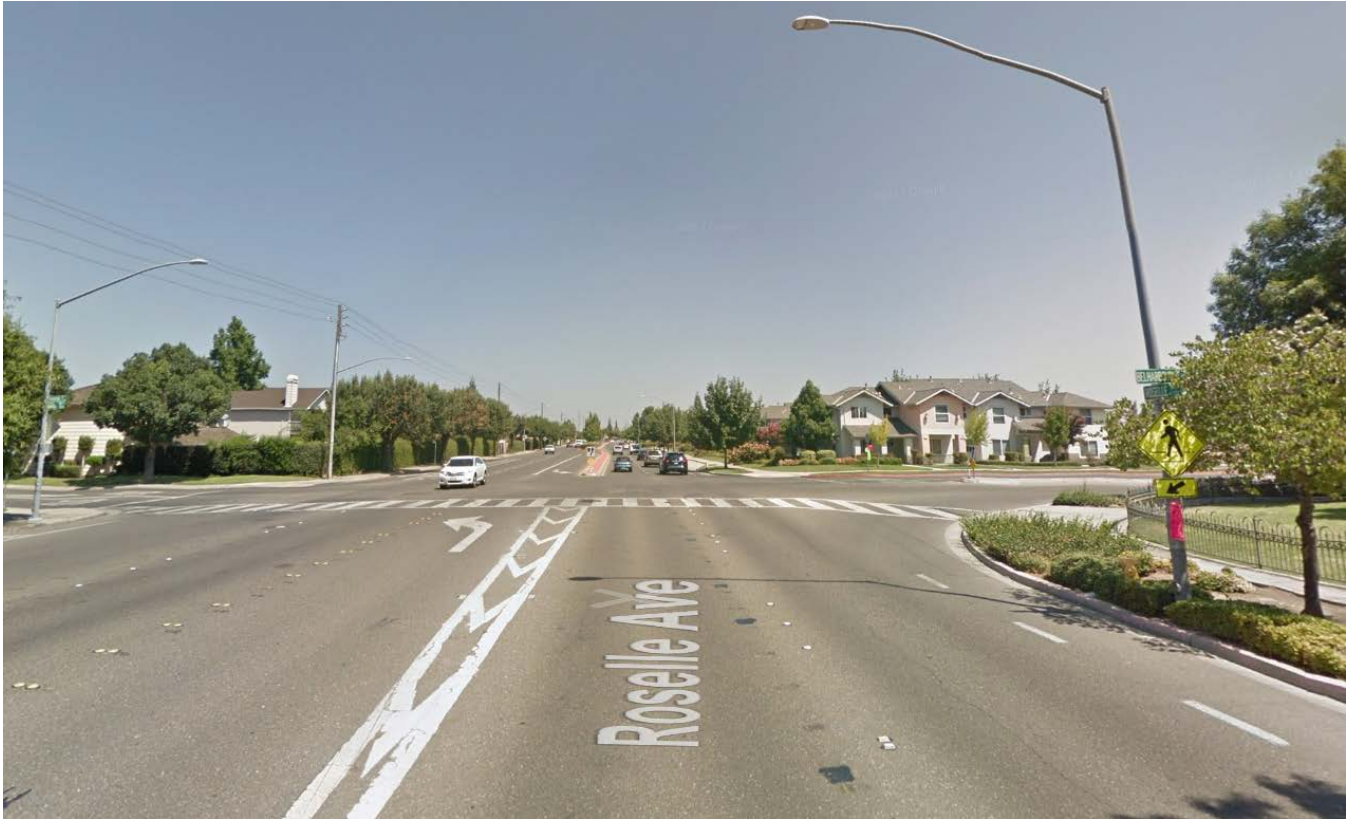
Roselle/Belharbour Intersection – Prior to Improvements