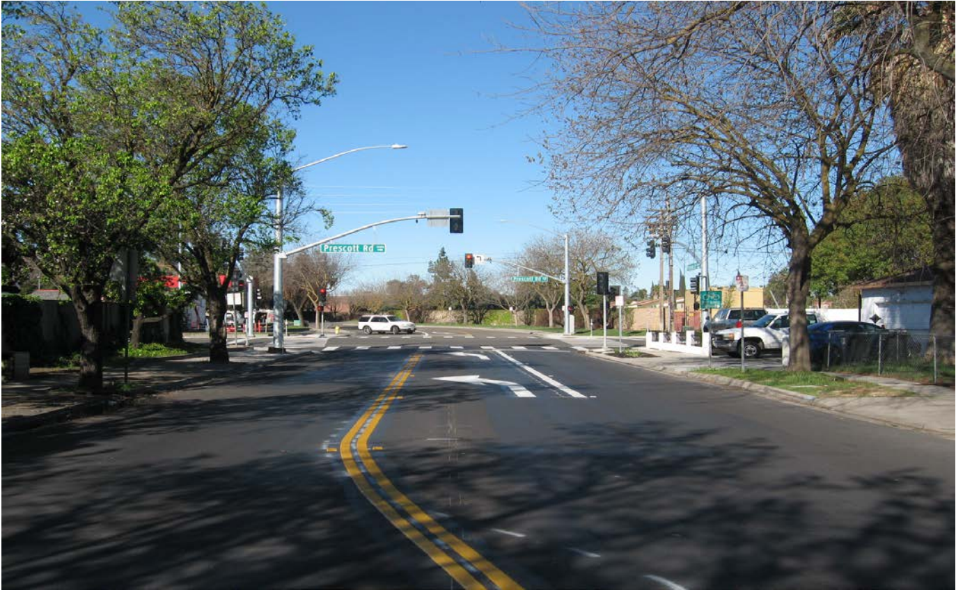
Prescott/Mt. Vernon Intersection - After Improvements