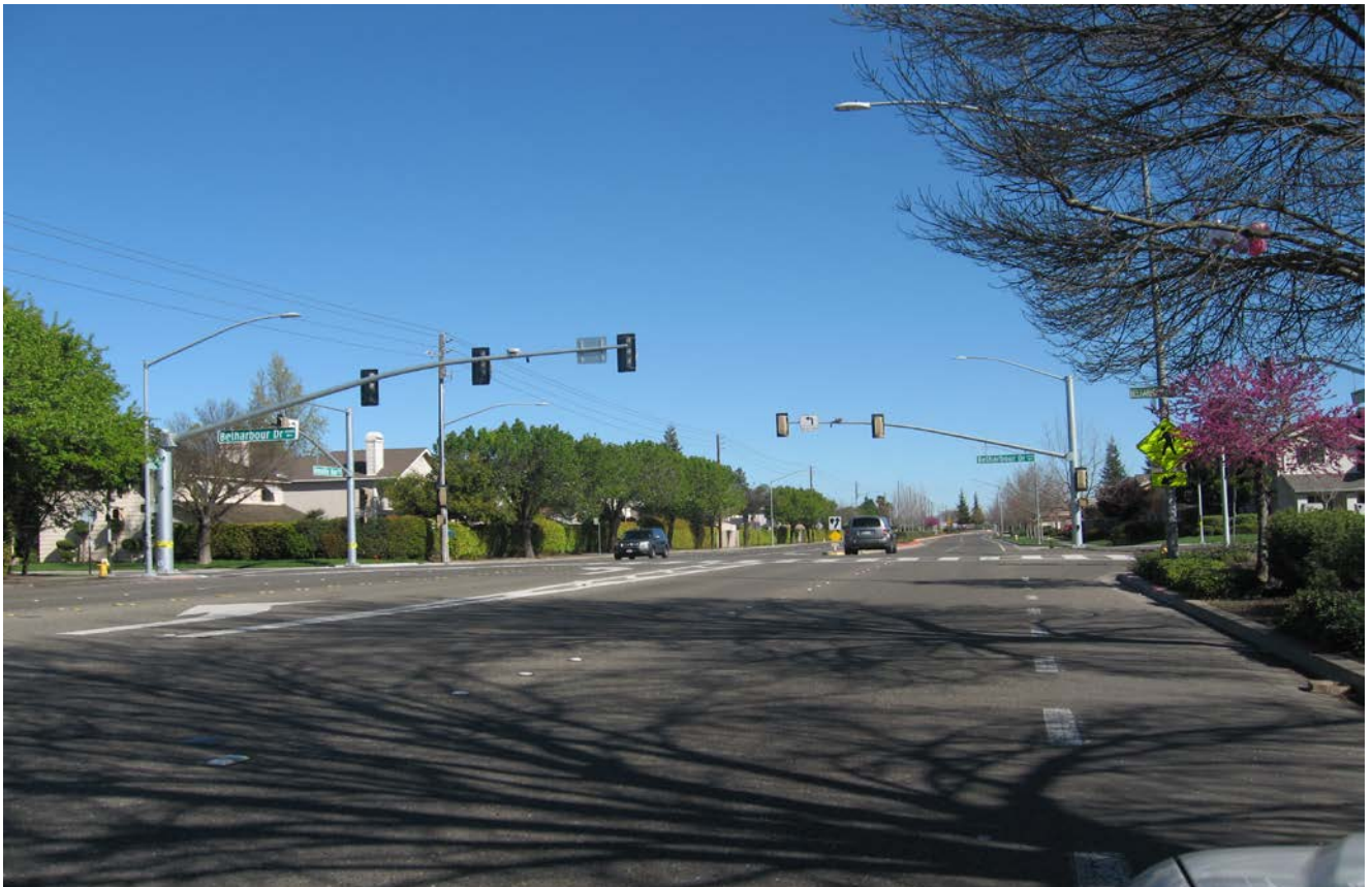
Roselle/Belharbour Intersection - After Improvements