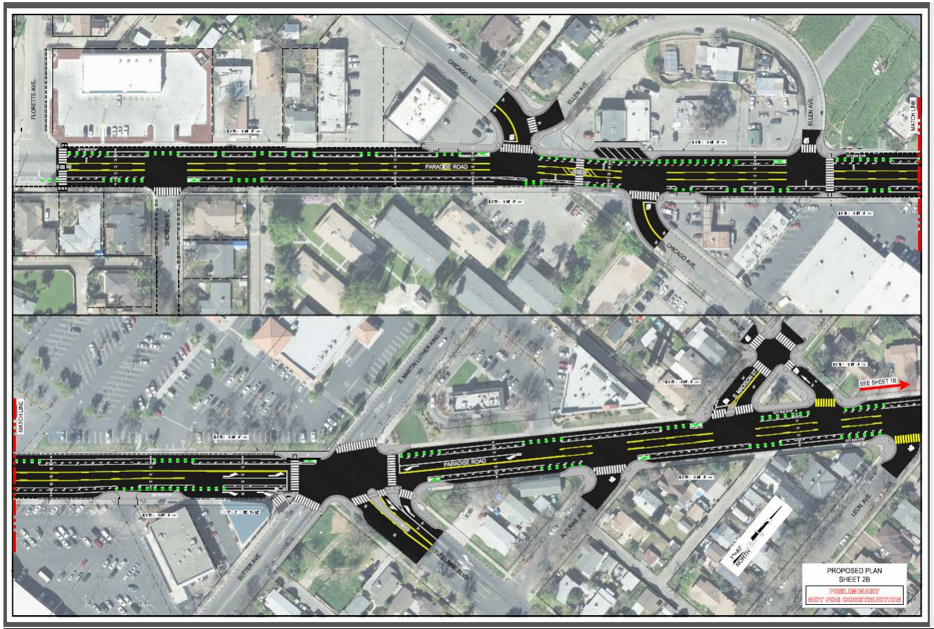
Paradise Road Project (Schematic)