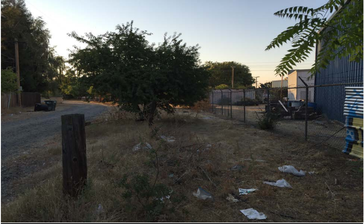
Prior to Construction