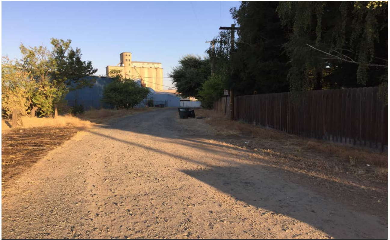
Prior to Construction